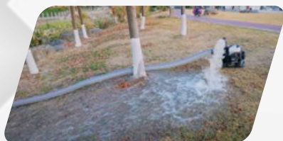
Well water lifting